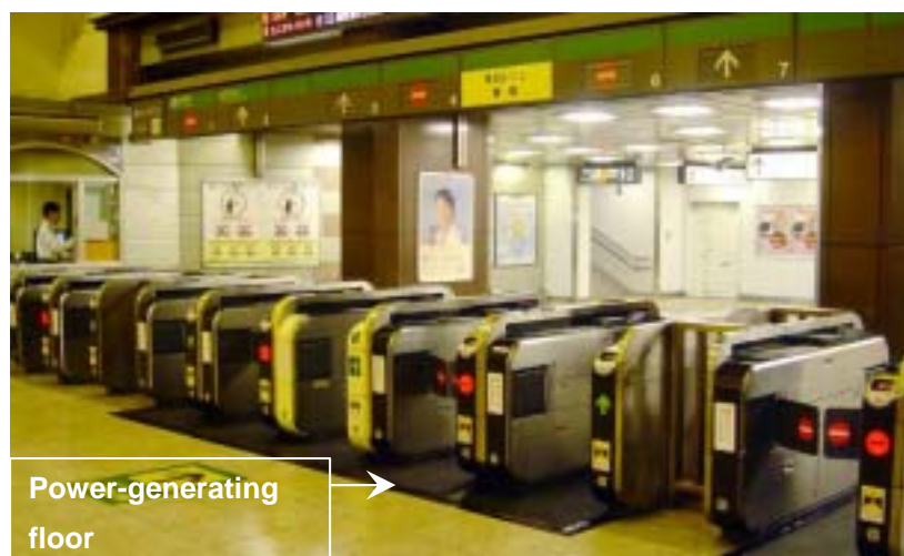
Photo: Last year's experimental Power-generating floor at Tokyo Station's Marunouchi North Exit

From the 3 rd week of the experimental period (a total of 800,000 people passing), production of electricity decreased due to a degradation in durability.